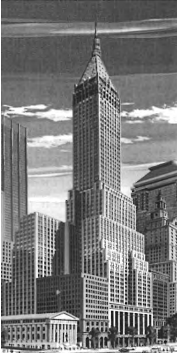
40 Wall Street