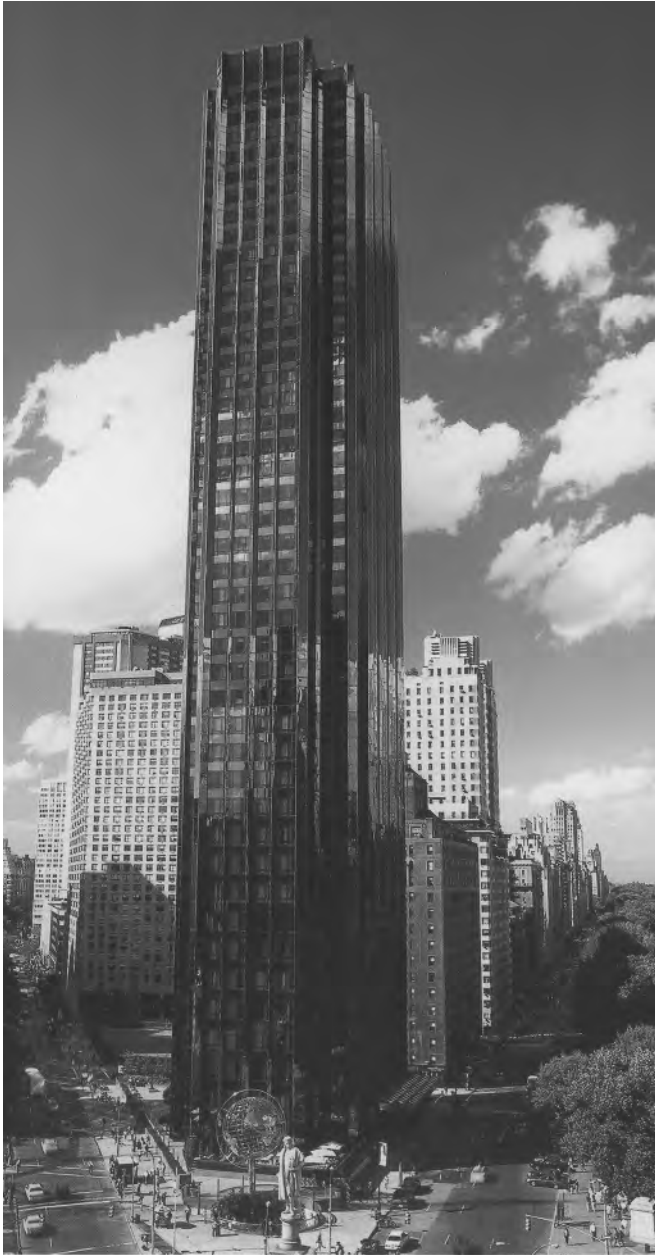
Trump International Hotel and Tower