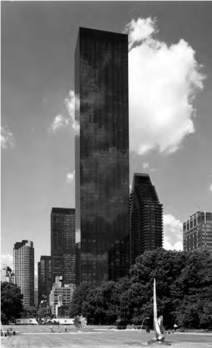
Trump World Tower at United Nations Plaza